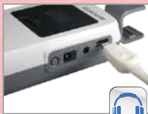
Support Earphone Output